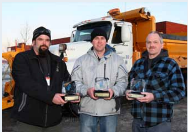
Winners of the snowplow Championship